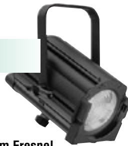
Acclaim Fresnel Selecon Performance Lighting